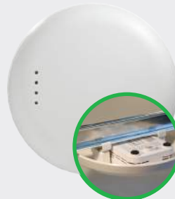
Indoor Ceiling Enclosure