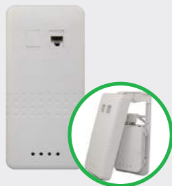
Indoor Ethernet Jack Enclosure