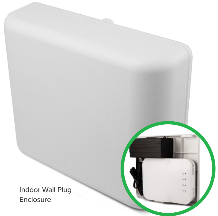
Indoor Wall Plug Enclosure

With Open Mesh enclosures and access points, you can deploy custom-tailored wireless networks at a fraction of the time and cost of traditional networks.