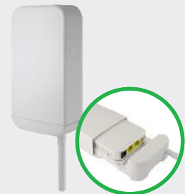
Outdoor Wall/Pole Enclosure