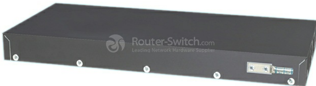
Figure 3 shows the back view of A901-12C-F-D.